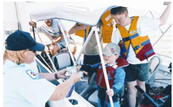
NSW Maritime Boating Officer chats to some children about safety during an on-water check.