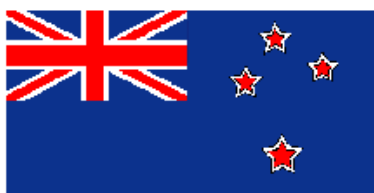
New Zealand flag