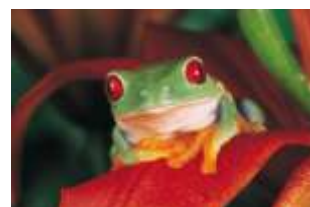
Agalychnis callidryas

There is growing concern around the world about the potential for the extinction of frogs. As a result of these concerns, an international breeding program, called Amphibian Ark , has been designed to try and save hundreds of species . There are about 6000 amphibian species worldwide, with about 2000 now threatened with extinction.