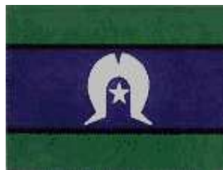
Torres Strait Islander flag