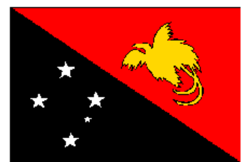
Papua New Guinean flag