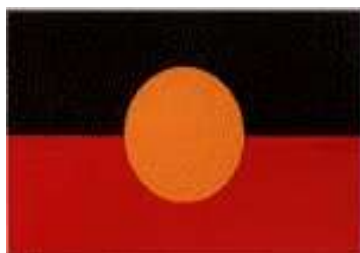
Australian Aboriginal flag